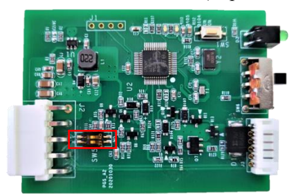
Figure 1.2 dial switch

Through the dialing control inside the control box, as shown in the red box in Figure 1.2 below. The IO input signal of gripper can be set to NPN or PNP.(Input 0V valid or 24V valid)