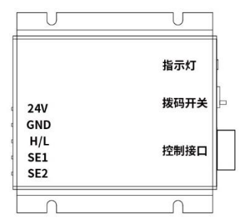
Figure 1.1 Controller

The clamping claw is equipped with a control box, which is mainly used to control the opening and closing of the electromagnetic claw. As shown in Figure 1.1: